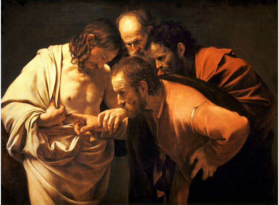
Caravaggio (1571-1610), The Incredulity of Saint Thomas