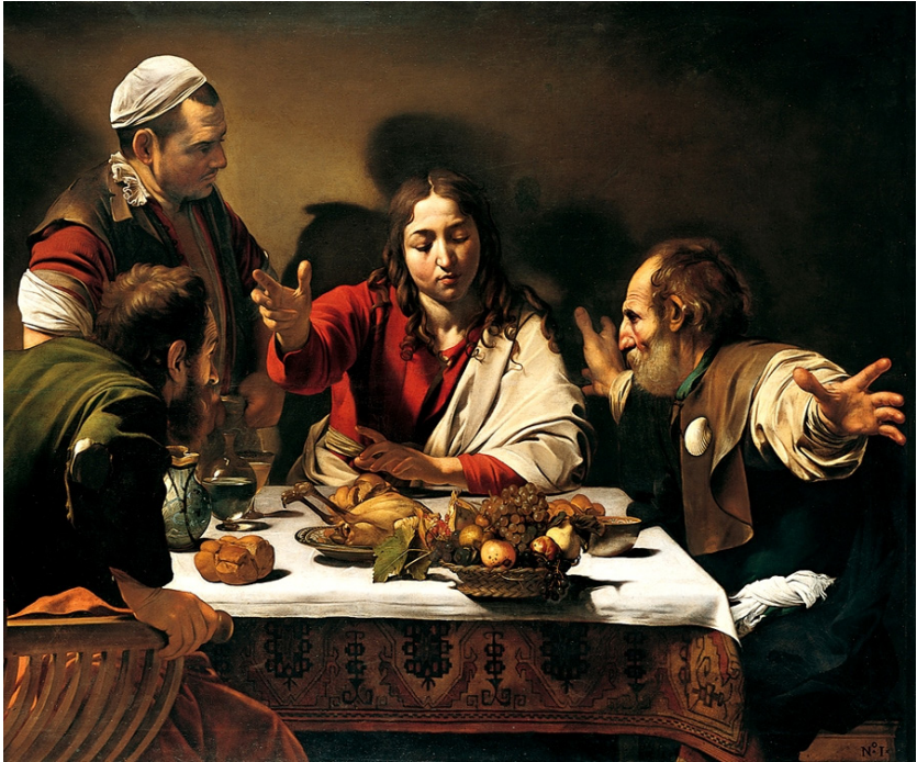
Caravaggio (1571-1610), Supper at Emmaus