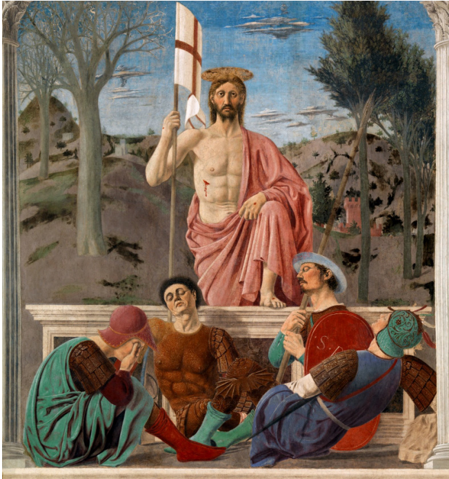
Piero della Francesca (1415-1492)